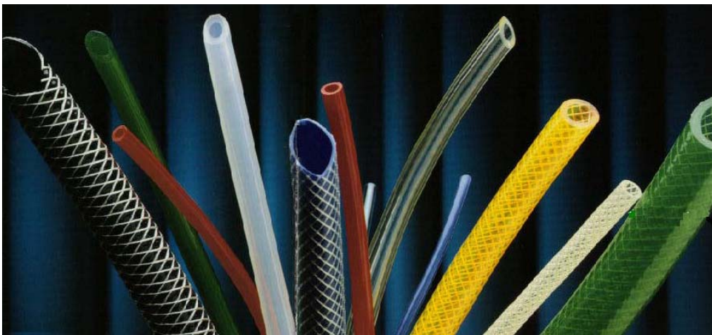
BASF's Elastollan® Lo-Tac - High performance TPU pneumatic tubing