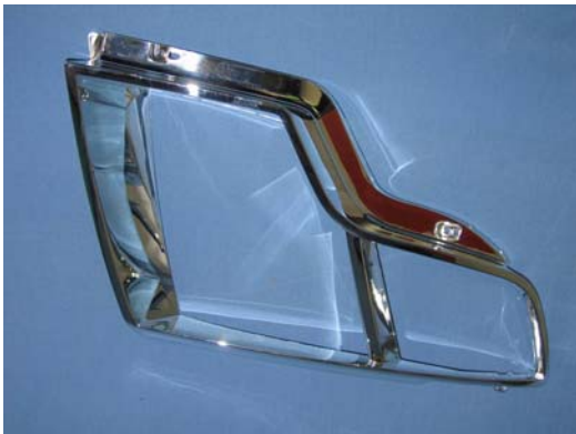
Suggested caption: Bezel exhibits excellent surface appearance and high-gloss

BASF is the world's leading chemical company: The Chemical Company. Its portfolio ranges from oil and gas to chemicals, plastics, performance products, agricultural products and fine chemicals. As a reliable partner, BASF helps its customers in virtually all industries to be more successful. With its high-value products and intelligent solutions, BASF plays an important role in finding answers to global challenges, such as climate protection, energy efficiency, nutrition and mobility. BASF has more than 95,000 employees and posted sales of almost €58 billion in 2007. BASF shares are traded on the stock exchanges in Frankfurt (BAS), London (BFA) and Zurich (AN). Further information on BASF is available on the Internet at www.basf.com .