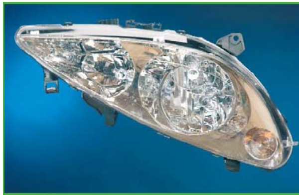
Suggested caption: Peugeot 307 headlamp assembly features BASF's Ultradur® B4560 Direct Metallizable PBT